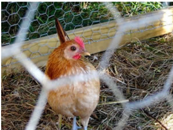
Hexagonal Wire Netting