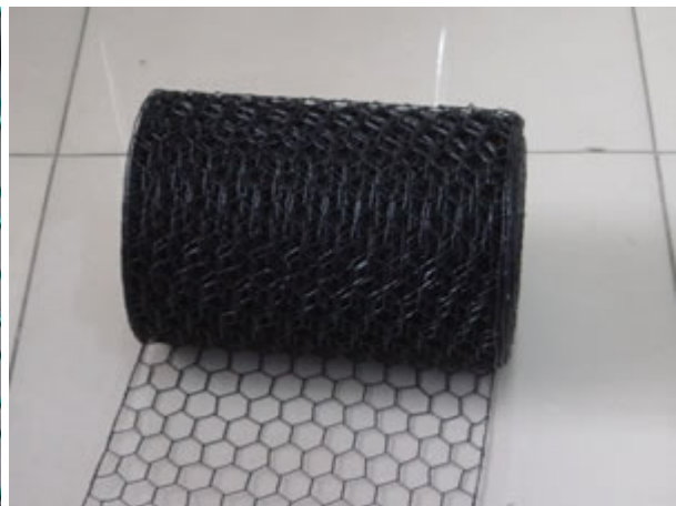
Hexagonal Wire Netting