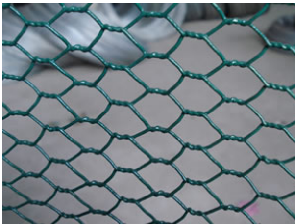
Hexagonal Wire Netting

Popularly it is used as fences after green coated, and costs can be reduced.